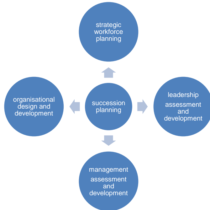
Figure 1 Activities included in the succession planning process

In its classical definition, succession planning normally deals with the highest two or three levels of the organisation.